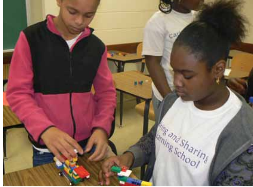
Children at GatorTRAX build LEGO® cars to race them.